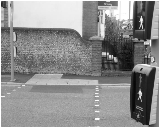
One of the new crossings – this one over the Upper Lewes Rd, the other new one allows safe crossing of Ditchling Rd on north side of Upper Lewes Rd.

The Upper Lewes Road is likely to be a key cycling route, but how to make it safer for pedestrians to cross and cyclists to use when 'chicane parking' causes vehicles to queue and dash between oncoming traffic bursts?