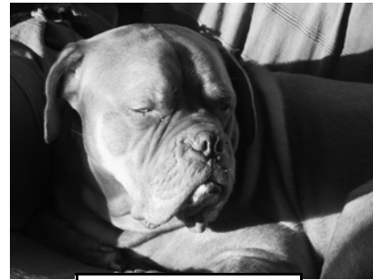
Phoarg! Not again!!

I know several dog owners in this area who are extremely responsible, take their dogs out for long walks on the Downs and if their dogs ever make a mess in the street, they clear it up after them.